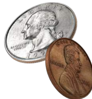
Using a quarter or penny is a great way to mark an open train or station.

If Player 1 does not have a double, play moves clockwise to the next player. If no one has a double, go around again drawing 1 tile from the boneyard until someone does.